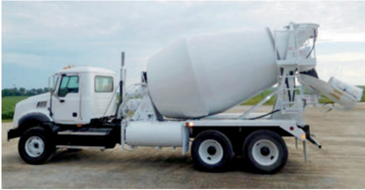
2008 Mack GU813 , MP7 engine, T310MLR trans., 224" WB, Mack rears w/Spring susp., 10.5 yd MTM mixer. Located in MN. #19