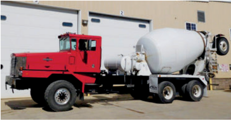
2-2000 Oshkosh F2146 6x6 , ISM Cummins engine, RT014909MLL trans., 232" WB, RT46-160 rears w/HN 72" susp., 10 yd MTM Bridgemaster mixer. #43