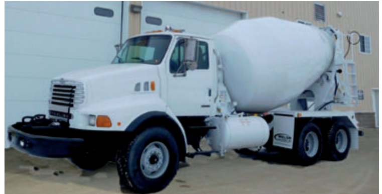
2-2007 Sterling 9513 , MBE 4000 engine, RT014909ALL trans., 224" WB, RT46-160 rears w/Chalmers susp., 10.5 yd MTM mixer. Located in MN and GA. #46