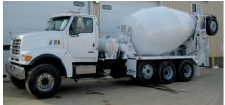
7-2005 Sterling 9511 , C11 Cat engine, RT014909ALL trans., 248" WB, RT46-160 rears w/HN susp., 5 axle, 11 yd MTM Bridgemaster V mixer. Located in MN. #52