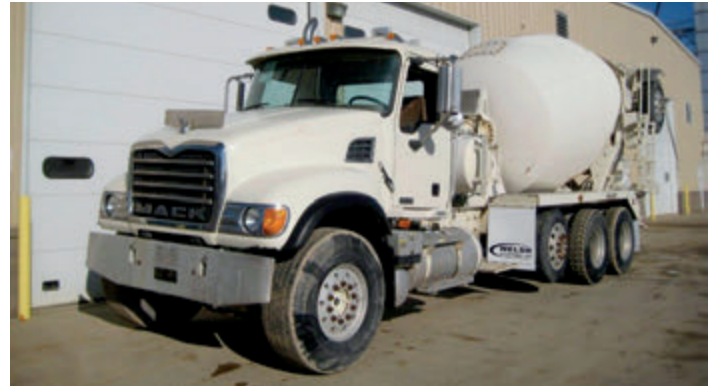
2-2007 Mack CV513 , AMI engine, T310MLR trans., 248" WB, Mack rears w/Beam susp., 5 axle, 11 yd Houbly Bridge mixer. Located in MN. #22