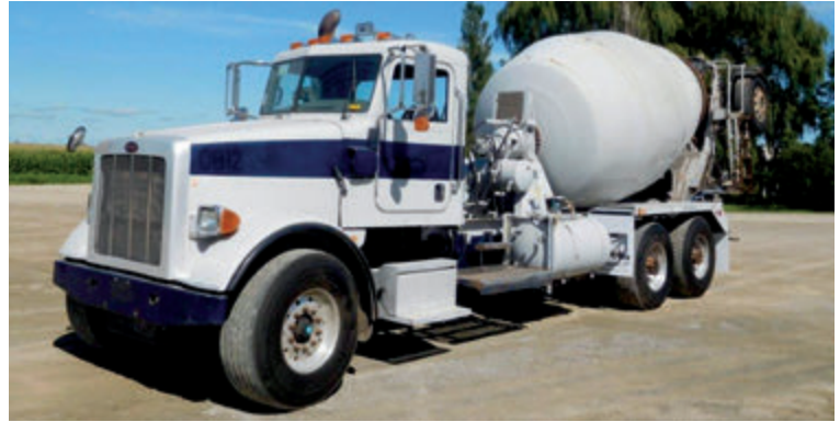
2-2009 Peterbilt 365 , ISM Cummins engine, 4500 Allison trans., 248" WB, D46-170HP rears w/Chalmers susp., 11 yd MTM Bridgmaster V mixer. Located in MN. #8