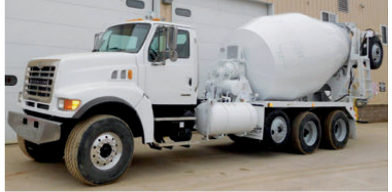
2003 Sterling 9511 , ISM Cummins engine, RT014909ALL trans., 248" WB, RT46-160 rears w/ Chalmers susp., 5 axle, 11 yd MTM Bridgemaster V paver mixer, new Con-Tech HP drum. Located in MN. #56