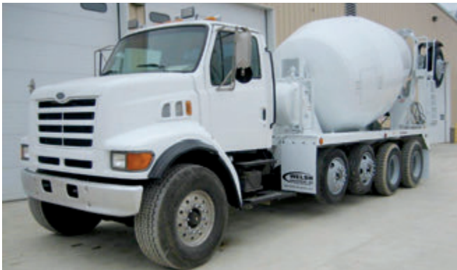
1-1998, 1-1997 Ford 9511 , M11 Cummins engine, RT014909MLL trans., 248" WB, RT46-160 rears w/RS460 susp., 6 axle, 11 yd MTM Bridgemaster mixer. #63