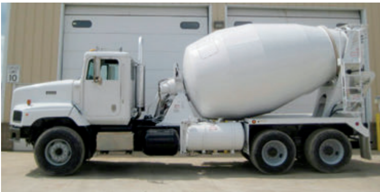
1997 International Paystar SBA , M11 Cummins engine, RT014909MLL trans., 212" WB, RT46-160 rears w/RS460 susp., 10.5 yd MTM mixer. #83