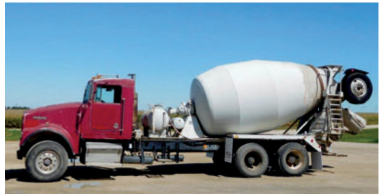
1996 Kenworth W900 , 3306 Cat engine, RT014909MLL trans., 248" WB, 12 yd MTM Bridgemaster mixer. Located in MN. #6

TRADE YOUR USED MIXERS AGAINST NEW, IN STOCK CON-TECH MIXERS AND SAVE $$ ON TAXES WITH THE SECTION 179 DEDUCTION