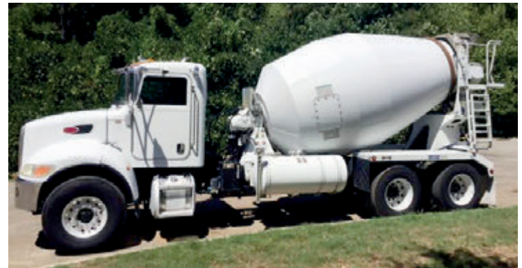
2008 Peterbilt 340 , PX8 engine, RT011908ALL trans., 232" WB, D46-170 rears w/HN susp., 10.5 yd CBMW mixer. Located in GA. #12

DUE TO THE LARGE GROUPS OF LIKE TRUCKS AT WELSH EQUIPMENT, REPRESENTATIVE PHOTOS MAY BE USED. IT IS THE BUYER'S RESPONSIBILITY TO VERIFY INDIVIDUAL SPECS BY SERIAL NUMBER.