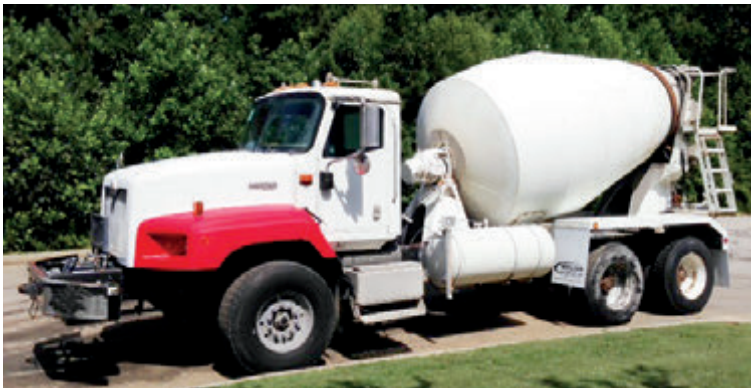
2-2007 International , ISX Cummins engine, 10.5 yd CBMW mixer. Located in GA. #75