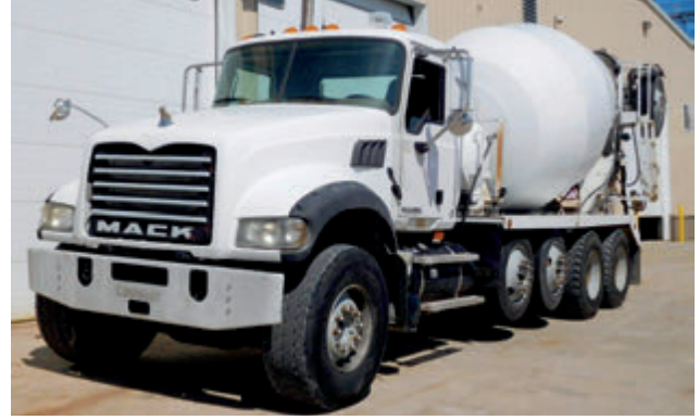
3-2009, 5-2008 Mack GU713 , MP7 engine, T310MLR trans., 248" WB, Mack rears w/Beam susp., 6 axle, 11 yd MTM Bridgmaster V mixer. Located in MN #20