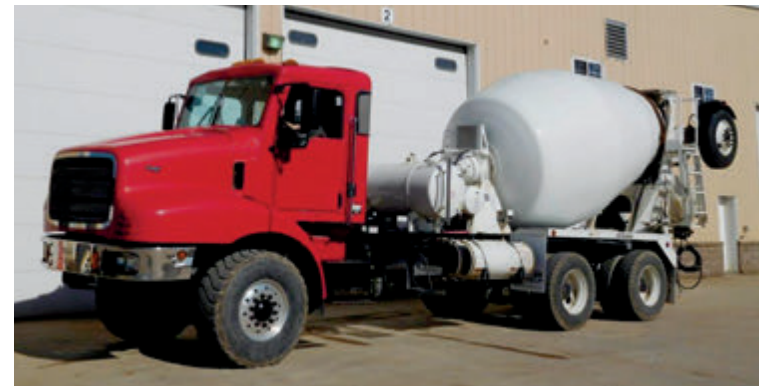
1-2005, 1-2005, 1-2001 Oshkosh F2146 6x6 , ISM Cummins engine, RT014909ALL trans., 232" WB, RT46-160 rears w/72" HN susp., 10 yd MTM Bridgemaster mixer. Located in MN. #42

FOR YOUR USED MIXER TRUCK NEEDS IN OUR GEORGIA LOCATION, CONTACT JIMMY HARMON @ 770-227-2001, 770-883-5405 OR EMAIL @ jharmon@welshequipment.com