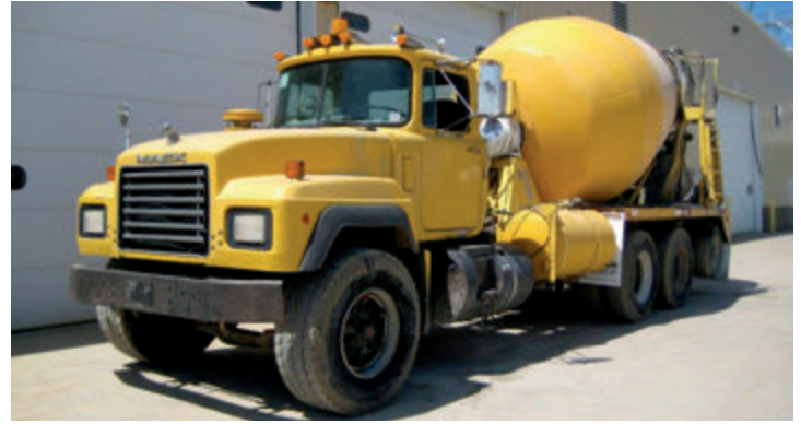
1995 Mack RD690 , E7-300 engine, T2080 trans., 224" WB, Mack rears w/Spring susp., 9.5 yd MTM mixer. Located in MN. #38