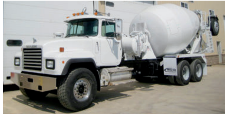
3-2001, 2-2000, 1-1998, 2-1997, 1-1995 Mack RD690 , E7-300 engine, T2080 trans., 248" WB, Mack rears w/Beam susp., 11 yd MTM Bridgmaster mixer. Some have pushers. Located in MN. #34