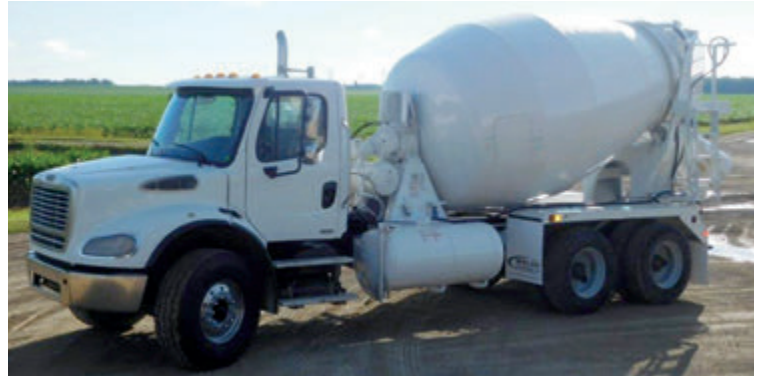
2-2009 Freightliner , M2 0M460LA engine, RT014909ALL trans., 248" WB, RT46-160 rears w/HN susp., 10.5 yd MTM mixer. Located in GA. #16