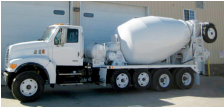
2-2006, 3-2005 Sterling 9511 , C11 Cat engine, RT014909ALL trans., 260" WB, RT46-160 rears w/HN susp., 6 axle, 11 yd MTM Bridgemaster V mixer. Located in MN. #51