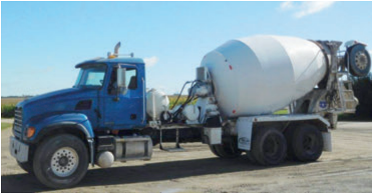
2-2007, 1-2005 Mack CV513 , AMI engine, RT014909ALL trans., 248" WB, RT46- 160 rears w/ Chalmers susp., 11 yd CBMW Bridge mixer. Located in MN. #21