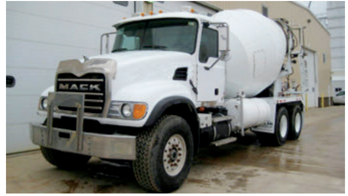
1-2005, 3-2004, 1-2002 Mack CV713 , AMI engine, RT014909ALL trans., 224" WB, RT46-160 rears w/HN susp., 10.5 yd CBMW mixer. #26