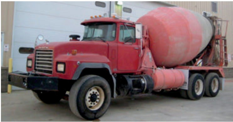
1-1997, 1-1996 Mack RD690 , E7-300 engine, T2080B trans., 224" WB, Mack rears w/Beam susp., 10.5 yd MTM paver mixer. Located in MN. #37