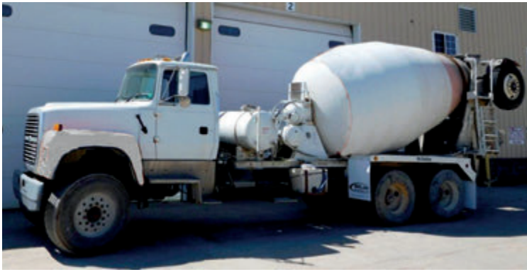
1-1995, 1-1994, 1-1993 Ford L8000 , 8.3 Cummins engine, RT014909MLL trans., 248" WB, RT46-160 rears w/RS460 susp., 10.5 yd MTM Birdgemaster Mixer. #67