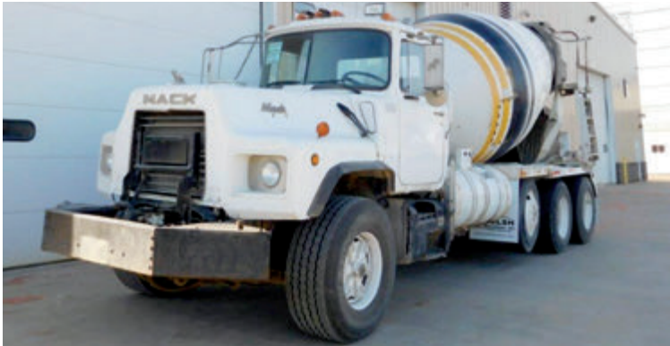
1994 Mack DM , E7-300 engine, T2080 trans., 212" WB, Mack rears w/Spring susp., 10 yd CBMW mixer. Located in MN. #39