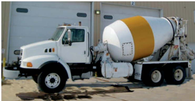
2-1998 Ford 8513 , 3126 Cat engine, RT7608LL trans., 1-9.5 yd MTM mixer, 1-9.5 yd Smith mixer. #65