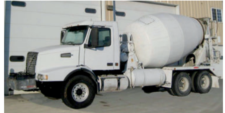
2003 Volvo VHD8 , Volvo engine, RT014909ALL trans., 212" WB, 11 yd MTM mixer. Located in GA. #40