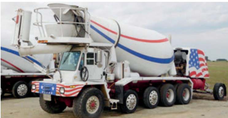
2006 Oshkosh S2346 6x6 , C13 Cat engine, 4500 Allison trans., 208" WB, double frame, RT46-160 rears w/Chalmers susp., 6 axle, 11 yd Loadspan mixer. Located in MN. #41