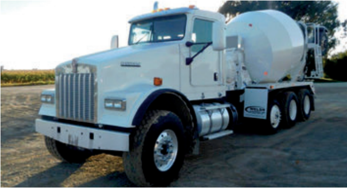
2014 Kenworth W900 , MX13 engine, 4500 Allison trans., D46-170HP rears w/HN susp., 5 axle, 11 yd MTM Bridgemaster V mixer. Located in MN. #1