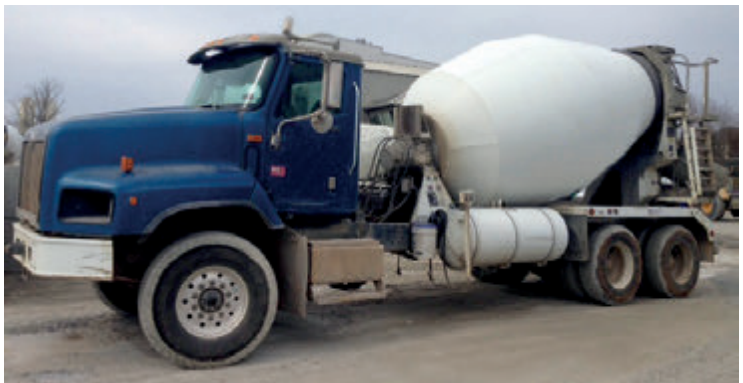
2012 International 5600i , ISM Cummins engine, RT014909ALL trans., 222" WB, RT46-160 rears w/HN susp., 10.5 yd CBMW mixer. Located in GA. #71