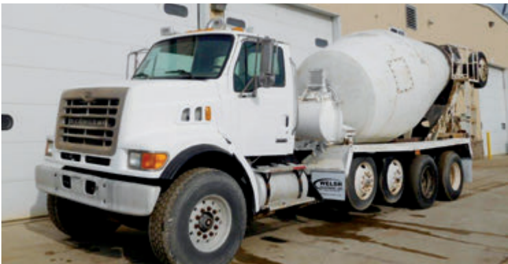
2-2002 Sterling 9511 , C10 Cat engine, RT014909ALL trans., 248" WB, RT46-160 rears w/RS460 susp., 6 axle, 11 yd Kimble Bridge mixer. Located in MN. #59