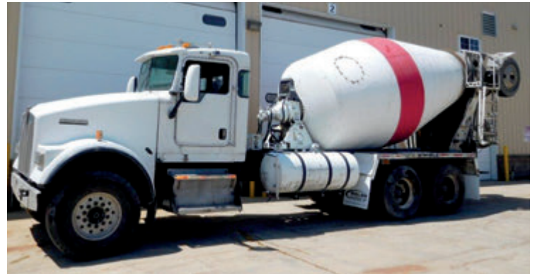
3-2005 Kenworth W900 , C13 Cat engine, RT014909ALL trans., 248" WB, D46-170HP rears w/Chalmers susp., 11 yd Kimble Bridge mixer. Located in MN. #4