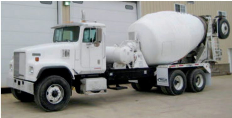
1999 International Paystar 5000 SFA , ISM Cummins engine, RT014909ALL trans., 248" WB, RT46-160 rears w/HN susp., 11 yd MTM Bridgemaster mixer. Located in MN. #81