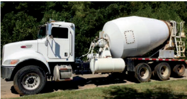
2008 Peterbilt 340 , ISC Cummins engine, RT014909ALL trans., 232" WB, D46-170HP rears w/HN susp., 10.5 yd CBMW mixer w/tag axle. #9