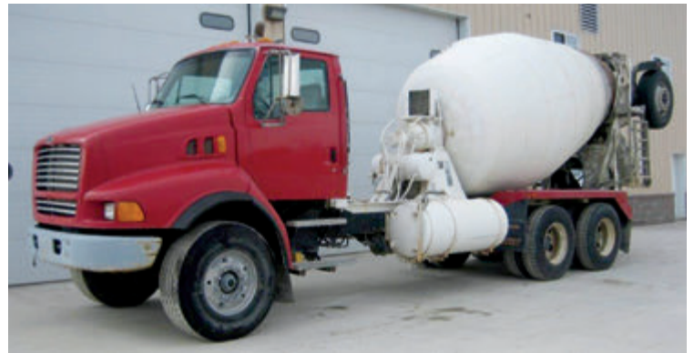
1998 Ford 8513 , 8.3 Cummins engine, RT7608LL trans., 236" WB, RT46-160 rears w/HN susp., 10 yd MTM Bridgemaster mixer. Located in MN. #64