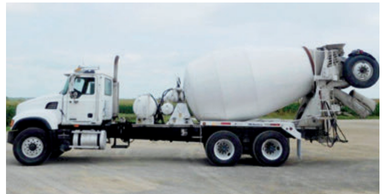
2005 Mack CV513 , AMI Mack engine, RT014909ALL trans., 248" WB, Mack rears w/Beam susp., 10.5 yd MTM Bridgemaster V mixer. #28