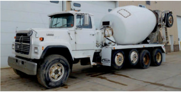
1989 Ford L9000 , L10 300 Cummins engine, RT014909MLL trans., 248" WB, RT46-160 rears w/RS460 susp., 6 axle, 11 yd MTM Bridgemaster mixer. #69