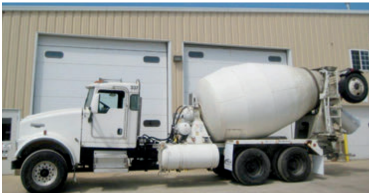
3-2003 Kenworth W900 , ISC Cummins engine, RT014909ALL trans., 248" WB, DSH44 rears w/Chalmers susp., 11 yd MTM Bridgemaster V mixer. Located in MN. #5