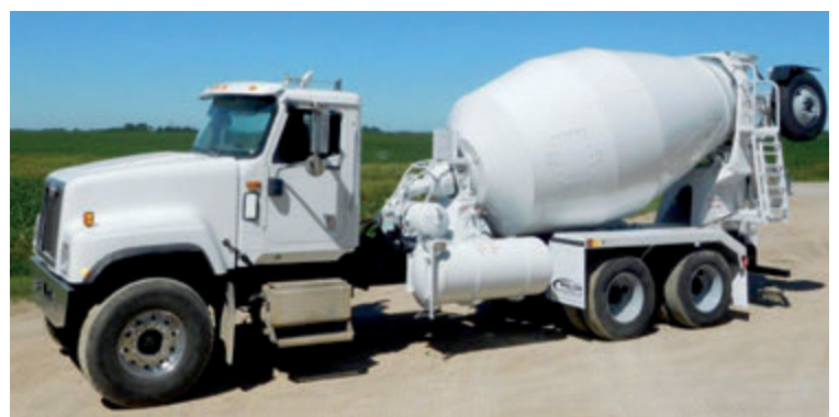
2-2013 International 5500i , Maxforce engine, RT014909ALL trans., RT46-160 rears w/HN susp., 11 yd CBMW mixer. Located in MN. #70