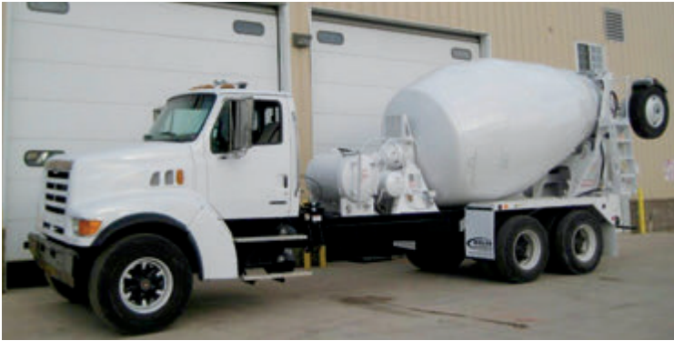
1-2003, 2-2002 Sterling 9511 , C10 on 2003, ISM Cummins on 2002, RT014909ALL trans., 260" WB, RT46-160 rears w/HN susp., 10.5 yd MTM Birdgemaster V mixer. Located in MN. #55