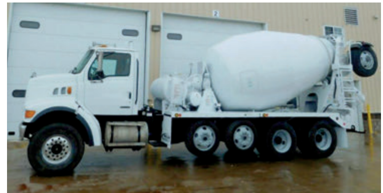
3-2001 Sterling 9511 , C10 Cat engine, RT014909ALL trans., 248" WB, RT46-160 rears w/HN susp., 6 axle, 11 yd MTM Bridgemaster paver mixers. Located in MN. #60

WE PAY TOP DOLLAR FOR SINGLE TRUCKS, MIXER FLEETS AND EQUIPMENT - CALL US TODAY!