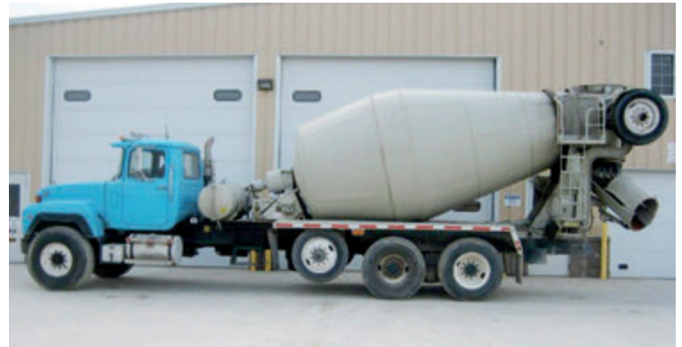
1-1998, 1-1996 Mack RD680 , E7-350 engine, 11 yd Kimble Bridge mixer. Located in MN. #36

NEW SELECTION OF MIXER TRUCKS ARRIVING DAILY WWW.WELSHEQUIPMENT.COM