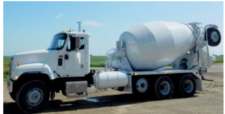
4-2006 International 5500i , ISM Cummins engine, RT014909ALL trans., 248" WB, RT46-160 rears w/HN susp., 5 axle, 11 yd MTM Bridgemaster V mixer. #76