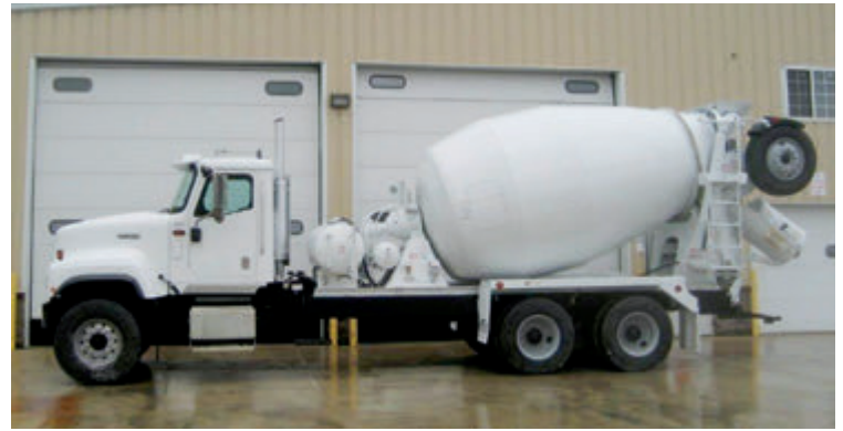
2000 International 5500i , ISM Cummins engine, RT014909MLL trans., 248" WB, RT46-160 rears w/HN susp., 11 yd MTM Bridgemaster mixer. #80