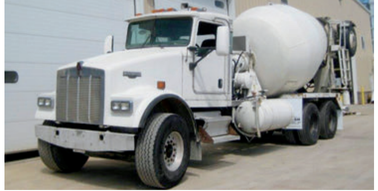
2007 Kenworth W900 , ISM Cummins engine, 4500 Allison trans., 248" WB, D46-170HP rears w/HN susp., 11 yd MTM Bridgemaster mixer. Located in MN. #2