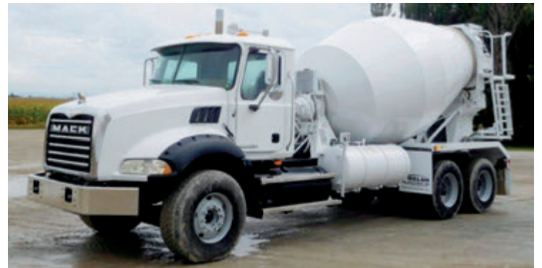
1-2009, 5-2008 Mack GU813 , MP7 engine, T310MLR trans., 224" WB, Mack rears w/Spring susp., 10.5 yd CBMW mixer. Located in MN and GA. #18

WE CAN HELP YOU WITH YOUR FINANCING NEEDS - UNBEATABLE LEASE RATES FOR USED TRUCKS