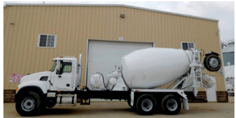
1-2006, 2-2005 Mack CV513 , AMI Mack engine, T310MLR trans., 248" WB, Mack rears w/Beam susp., 11 yd MTM Bridgmaster V mixer. Located in MN. #24

FOR ALL YOUR USED MIXER TRUCK NEEDS, CONTACT RICK WELSH @ 507-374-2261 OR Email @ rickweq@welshequipment.com