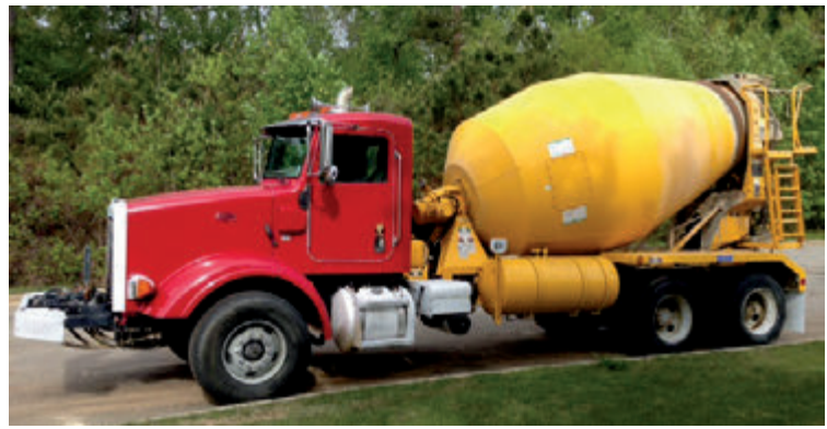
3-2008 Peterbilt 365 , ILS-330 Cummins engine, RT014909ALL trans., D46-170HP rears w/Chalmers susp., 10.5 yd CBMW mixer. Located in MN and GA. #10