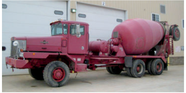
5-1996 Oshkosh F1840 6x6 , L10 Cummins engine, RT014909MLL trans., 232" WB, RT45-145 rears w/RS460 susp., 72" beam, 10 yd MTM Bridgemaster Mixer. Located in MN. #44