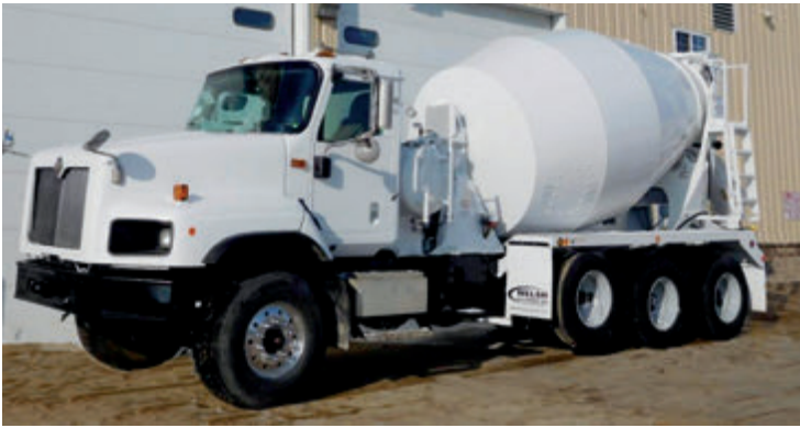
1-2002, 1-2001 International 5600i , ISM Cummins engine, RT014909ALL trans, 236" WB, RT46-160 rears w/ HN susp., 5 axle, 10.5 yd MTM mixer. Located in MN. #79