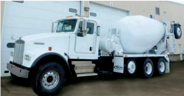
2006 Kenworth W900 , C13 Cat engine, 4500 Allison trans., 248" WB, D46-170HP rears w/HN susp., 5 axle, 11 yd MTM Bridgemaster mixer. Located in MN. #3