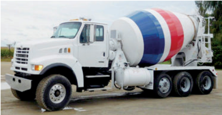
4-2007 Sterling 9511 , C11 Cat engine, RT014909ALL trans., 236" WB, RT46-160 rears w/HN susp., 10.5 yd MTM mixer, pusher axle. Some with new Con-Tech HP drums. Located in MN. #45