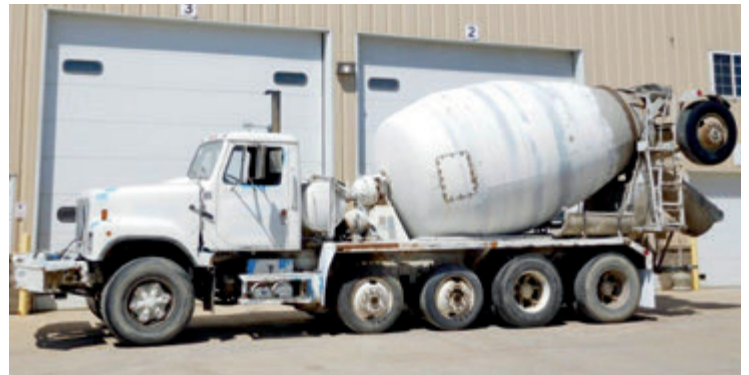
2-1988 Internatioanl S2500 , L10 300 Cummins engine, RT014909MLL trans., 248" WB, RT46-160 rears w/RS460 susp., 6 axle, 11 yd MTM Bridgemaster mixer. #84

IF YOU DON'T SEE WHAT YOU ARE LOOKING FOR - CALL US TOLL FREE AT 800-677-0574