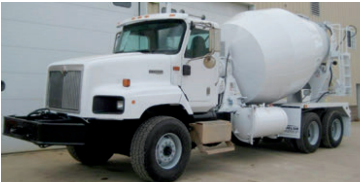
6-2007, 10-2005, 1-2004 International 5600i , ISM Cummins engine, RT014909ALL trans., 224" WB, RT46-160 rears w/HN susp., 10.5 yd MTM paver mixer. Located in MN and GA. #77