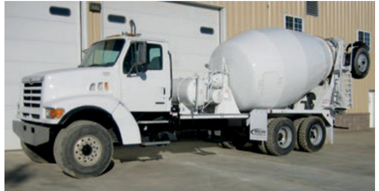
1-2003, 1-2001, 1-1999 Sterling 9511 , ISM Cummins engine, RT014909ALL trans., 248" WB, RT46-160 rears w/HN susp., 11 yd MTM Bridgemaster or Schwing mixer. Located in MN. #58