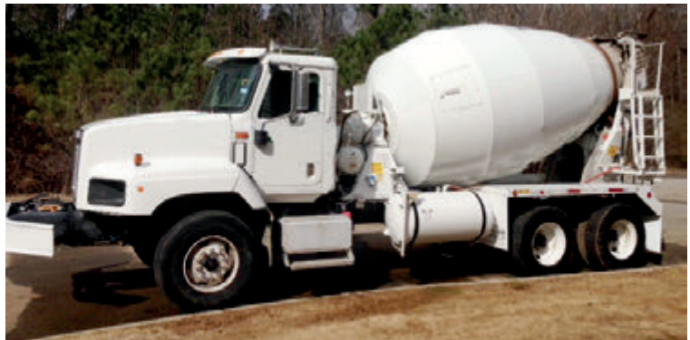
1-2003 International 5600i , ISM Cummins engine, RT014909ALL trans., 222" WB, RT46-160 rears w/HN susp., 10.5 yd MTM paver mixer. Located in GA. #78

WE HAVE ONE OF THE MOST MODERN TRUCK REPAIR AND PAINT FACILITIES IN THE U.S.A.