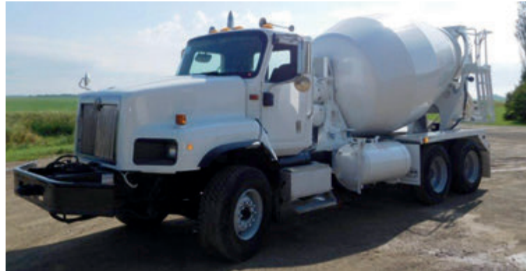
1-2007, 13-2006 International 5600i , ISM Cummins engine, 4500 Allison trans., 212" WB, RT46-160 rears w/ HN susp., 10.5 yd MTM mixer. Located in MN and GA. #74