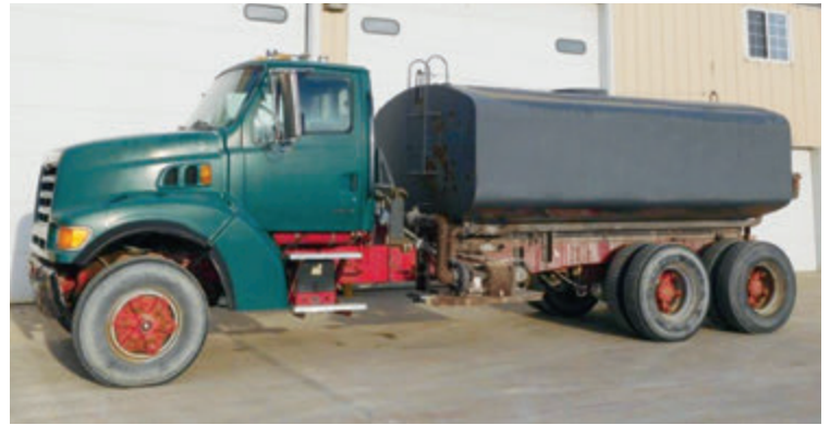
1999 Sterling 9511 , ISM Cummins engine, RT014909MLL trans., 260" WB, RT46-160 rears w/HN susp., Water tanker. #62