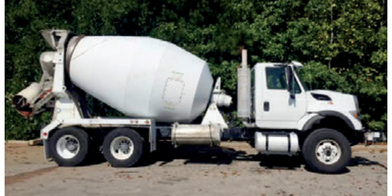
2011 International 7700i , Maxforce engine, RT014909ALL trans., 230" WB, RT46-160 rears w/HN susp., 10.5 yd CBMW mixer. Located in GA. #72