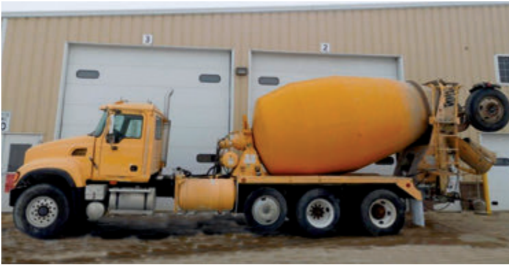
2002 Mack CV513 , E7-350 engine, RT014909ALL trans., 248" WB, RT46-160 rears w/Chalmers susp., 5 axle, 11 yd MTM Bridgmaster V mixer. Located in MN. #33