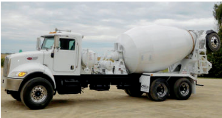
1-2009, 2-2008 Peterbilt 340 , ISC-330 Cummins engine, RT014909ALL trans., 248" WB, D46-170 HP rears w/ Chalmers susp., 11 yd CBMW Bridge mixer. Located in MN. #11