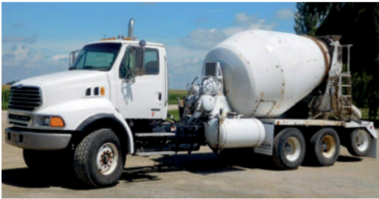
2-2007 Ford 8513 , ISC Cummins engine, RT011909ALL trans., 232" WB, RT45-145 rears w/HN susp., 9 yd MTM mixer, tag axle. #49