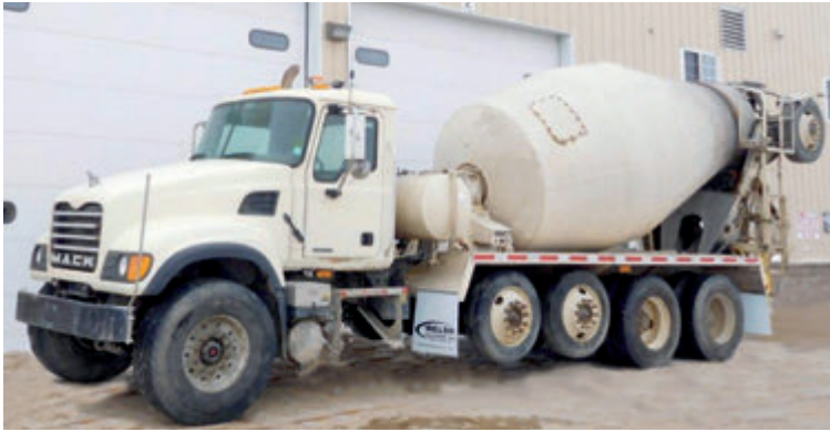
2-2003 Mack CV7133 , AMI engine, T310MLR trans., 248" WB, Mack rears w/Beam susp., 6 axle, 11 yd Kimble Bridge mixer. Located in MN. #31