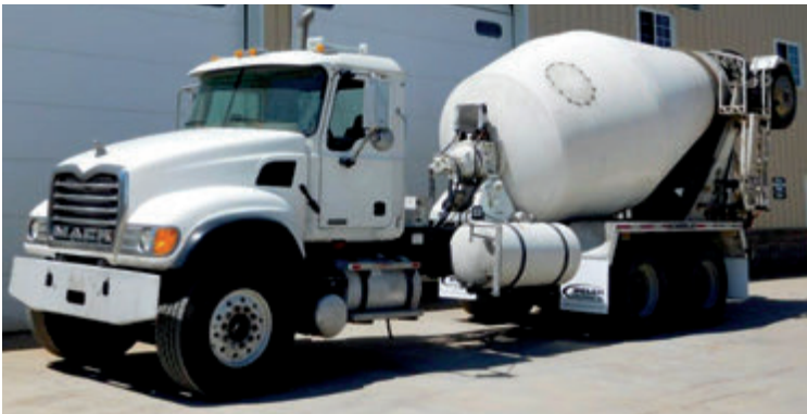
2007 Mack CV533 , ISL engine, RT014909ALL trans., 248" WB, Mack rears w/Chalmers susp., 11 yd Kimble Bridge mixer. #23