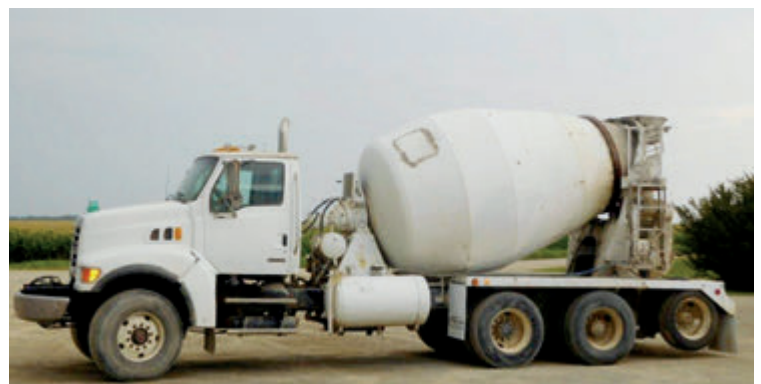
2-2007, 1-2005 Sterling 85115 , C7 Cat engine, RT011909ALL trans., 236" WB, RT45-145 rears w/HN susp., 10 yd MTM mixer, tax axle. Located in MN. #48