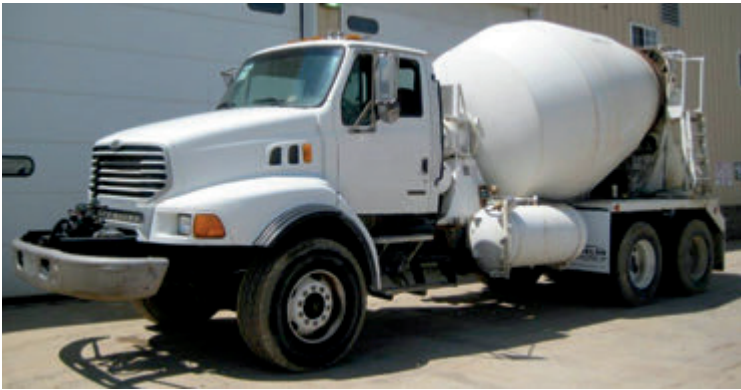
2-2001, 3-1999 Sterling 8513 , ISC Cummins engine, RT011908LL trans., 224" WB, RT45-145 rears w/HN susp., 9 yd MTM mixer. #61