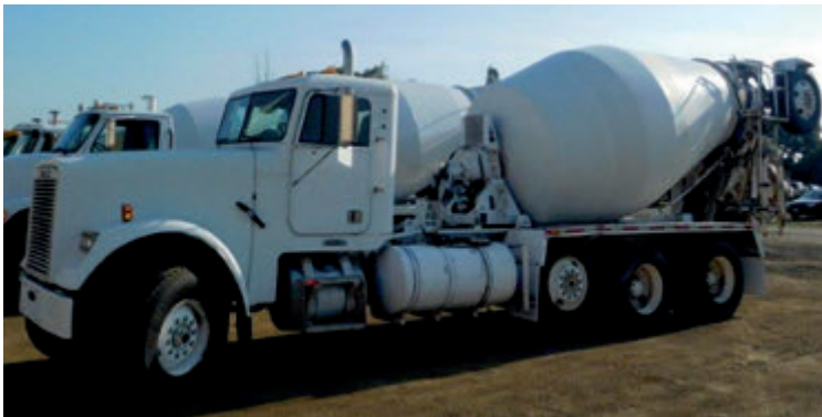
3-2003 Freightliner FDL120 , ISL Cummins engine, RT014909ALL trans., 248" WB, D405P rears w/Chalmers susp., 5 axle, 10.5 yd Kimble Bridge mixer. Located in MN. #17