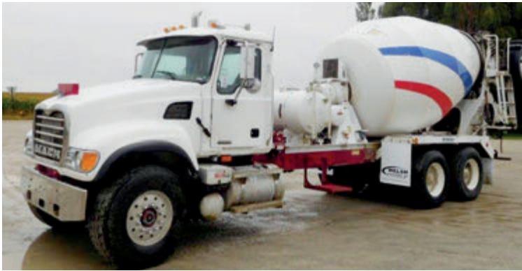
1-2005, 5-2004 Mack CV513 , AMI370 engine, 4500 Allison trans., 248" WB, Mack rears w/Beam susp., 11 yd MTM Bridgemaster V mixer. #27