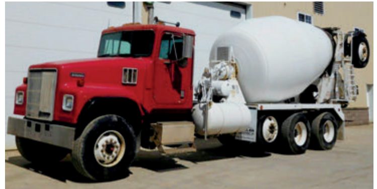
1-1999, 1-1997 International Paystar SFA , M11 Cummins engine, RT014909MLL trans., 248" WB, RT46-160 rears w/HN susp., 5 axle, 11 yd MTM Bridgemaster Mixer. Located in MN. #82