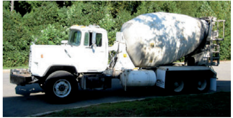
2004 Mack DM , AMI engine, T309M trans., 212" WB, Mack rears w/Spring susp., 10.5 yd Beck mixer. #32