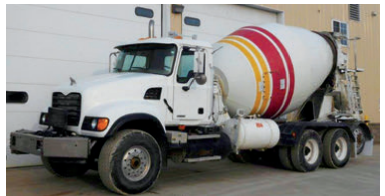
2-2004 Mack CV713 , AMI engine, TM307M trans., 228" WB, Mack rears w/Spring susp., tag axle, 10.5 yd CBMW mixer. Located in MN. #30

WE SHIP TRUCKS WORLDWIDE - YOUR ONE STOP EXPORT SPECIALIST