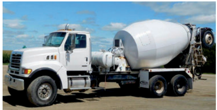
2004 Sterling 9511 , C12 Cat engine, 4500 Allison trans., 248" WB, RT46-160 rears w/T ride susp., 11 yd MTM Bridgemaster mixer, new Con-Tech HP drum. #54