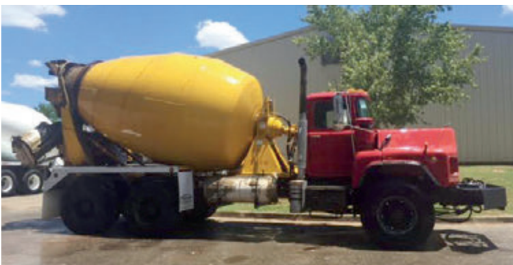
2000 Mack DM , E7-300 engine, T2080B trans., 212" WB, Mack rears w/Spring susp., 10.5 yd MTM mixer. #35