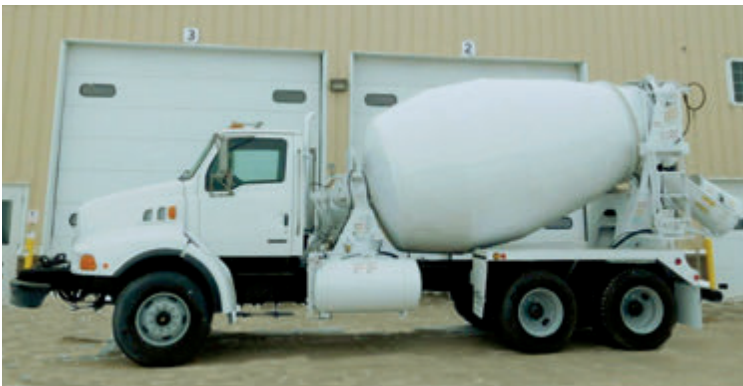
1-2007, 1-2006, 4-2005 Sterling 9 , 2007 is C13 Cat engine, 2006 and 2005 C11 Cat engine, RT014909ALL trans., 224" WB, RT46-160 rears w/Chalmers susp., 10.5 yd MTM mixer. #47