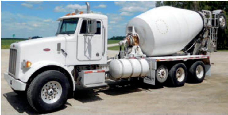
1-2005, 6-2004 Peterbilt 357 , ISL Cummins engine, RT014909ALL trans., 248" WB, D405P rears w/Chalmers susp., 5 axle, 10.5 yd Kimble Bridge mixer. Located in MN. #15