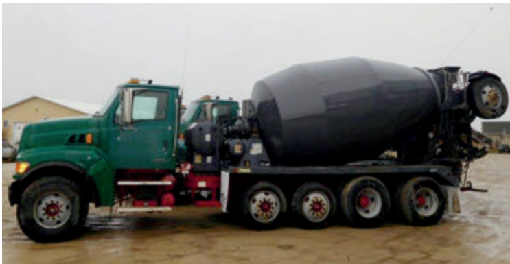
3-2004 Sterling , C10 Cat engine, RT014909ALL trans., 260" WB, RT46-160 rears w/HN susp., 6 axle, 12 yd MTM Bridgemaster V mixer, new Con-Tech HP drums. #53