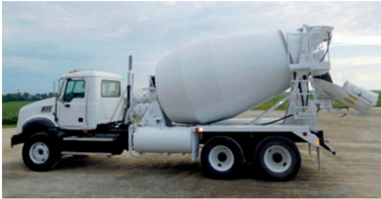
2005 Mack CT713 , AMI engine T310MLR trans., 224" WB, Mack rears w/Spring susps., 10.5 yd MTM mixer. Located in MN. #25