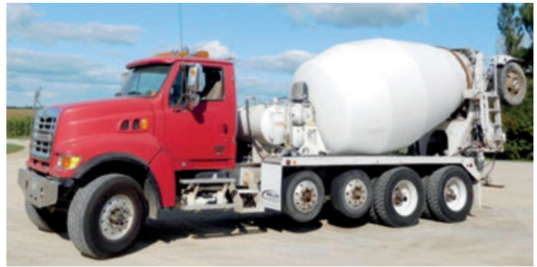
2-2006 Sterling 9511 , MBE 4000 engine, 4500 Allison trans., 248" WB, RT46-160 rears w/HN susp., 6 axle, 1-11 yd CTM BridgeKing mixer, 1-11 yd MTM Bridgemaster Mixer, Central tire inflation. Located in MN. #50