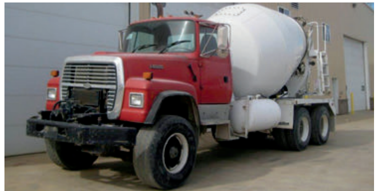
1996 Ford L8000 , 8.3 Cummins engine, RT7608LL trans., 222" WB, RT45-145 rears w/RS400 susp., 9 yd MTM mixer. #66

WE SHIP TO DESTINATIONS THROUGHOUT THE WORLD