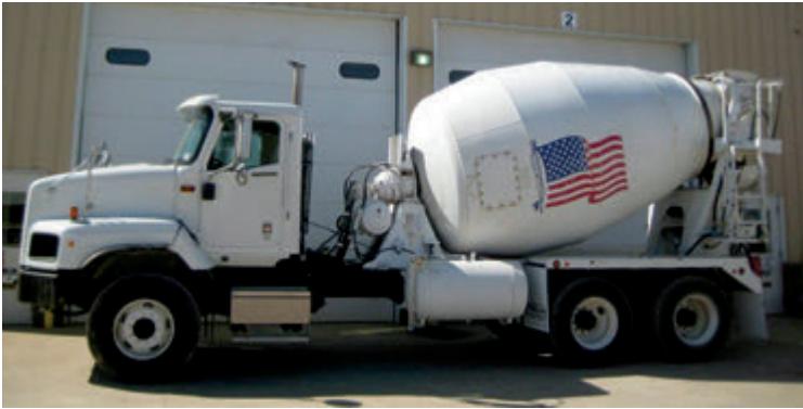
1-2010, 2-2009 International 5600i , ISM Cummins engine, 4500 Allison trans., 224" WB, RT46-160 rears w/ Chalmers susp., 10.5 yd MTM mixer. Located in GA. #73