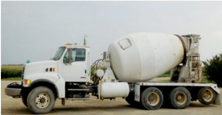
2-2003, 2-2002, 1-2001 Sterling 9511 , ISC Cummins engine, RT011909ALL trans., 236" WB, RT45-145 rears w/HN susp., 10 yd MTM mixer, tag axle. Located in MN. #57