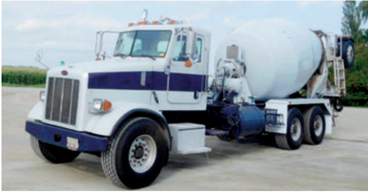
2-2007 Peterbilt 357 , ISM Cummins engine, RT014909ALL trans, 248" WB, D46-170 rears w/Chalmers susp., 11 yd MTM Bridgemaster V mixer. Located in MN. #13