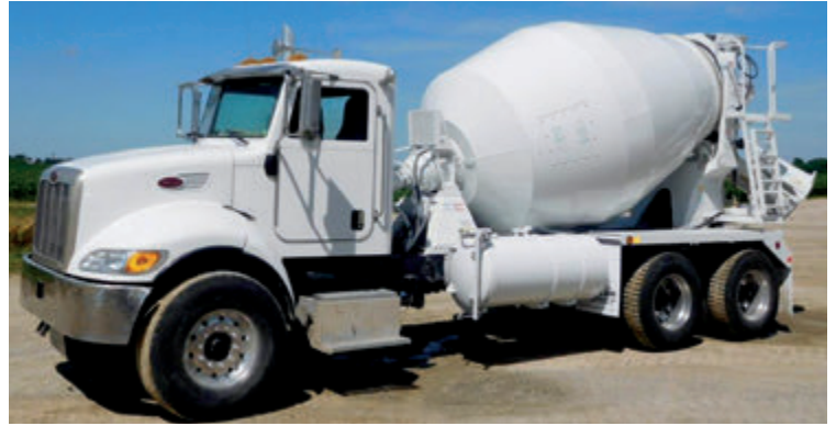
2-2006, 7-2005 Peterbilt 340 , ISC Cummins engine, 3500 Allison trans., 232" WB, RT46-160 rears w/HN susp., 9 yd CBMW mixer. Located in MN and GA. #14