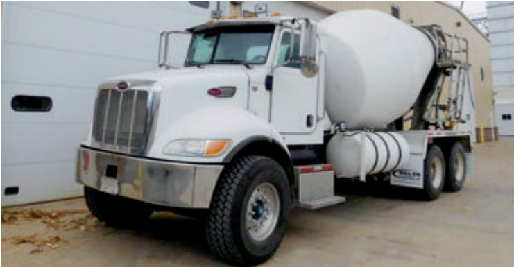
2009 Peterbilt 340 , PX8 engine, RT011908LL trans., 230" WB, D46-170HP rears w/Chalmers susp., 10 yd Kimble mixer. Located in MN. #7