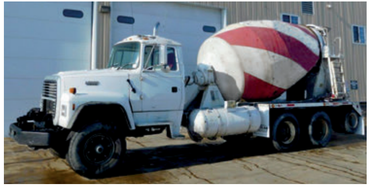
2-1991 Ford L8000 , 8.3 Cummins engine, RT7608LL trans., RT45-145 rears w/RS400 susp., 10 yd MTM mixer w/tag axle. #68